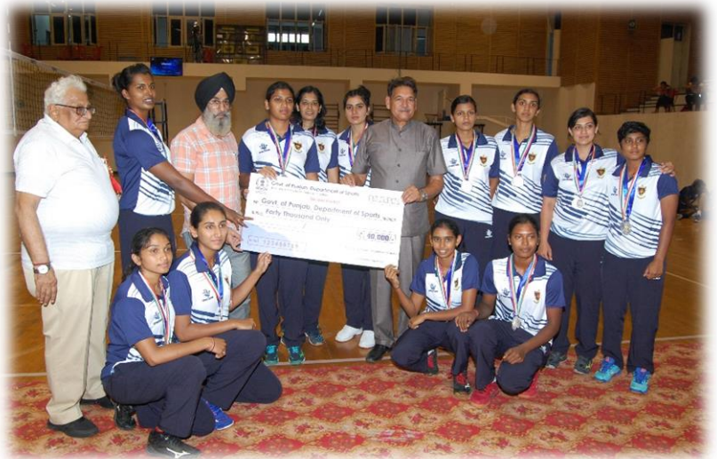
Gold Medal Winner Kerala Women Team