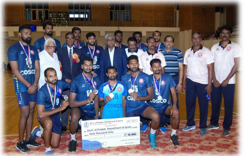
Gold Medal Winner Kerala Men Team