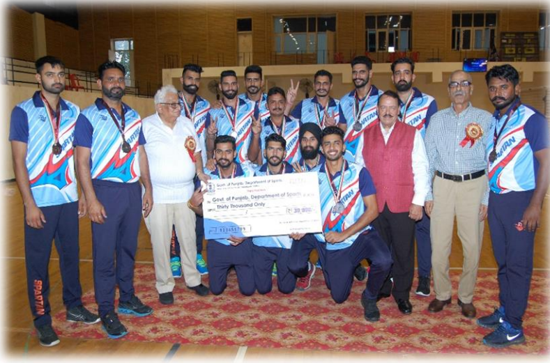
Bronze Medal Winner Punjab Men Team