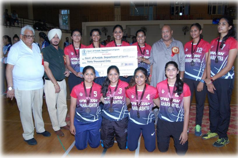
Bronze Medal Winner Maharashtra Women Team